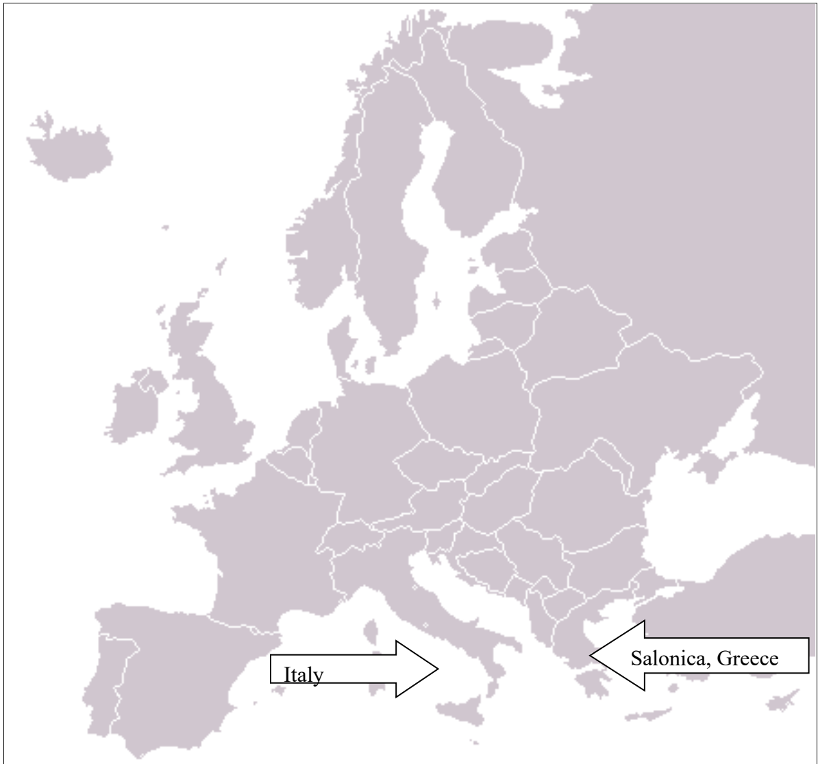
Map of Europe